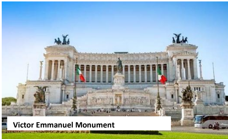
Victor Emmanuel Monument

Upon entry to the Vatican Museum, you'll have the opportunity to witness renowned classical sculptures and masterpieces from the Renaissance era. The tour also encompasses a visit to the