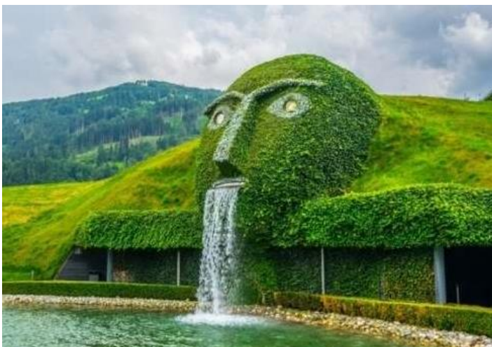
Swarovski Kristallwelten Wattens

Travel to Vaduz, the capital of the Principality of Liechtenstein, enjoying a delightful toy train journey. Explore the mesmerizing realm of crystals at the Swarovski Crystal Museum. Venture to Innsbruck, the picturesque Tyrolean capital of Austria.