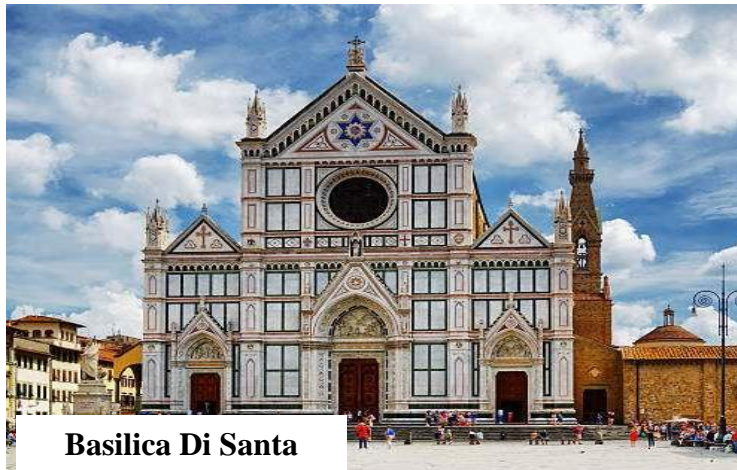
Basilica Di Santa

This morning, following your hotel checkout, we will commence a journey to Florence,