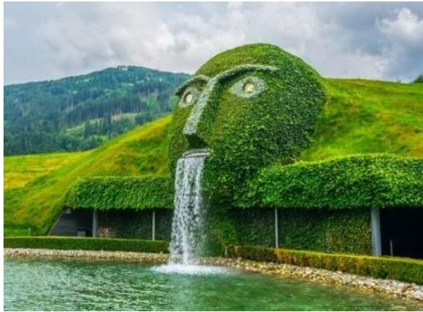
Swarovski Kristallwelten Wattens

Travel to Vaduz, the capital of the Principality of Liechtenstein, enjoying a delightful toy train journey. Explore the mesmerizing realm of crystals at the Swarovski Crystal Museum. Venture to Innsbruck, the picturesque Tyrolean capital of Austria.