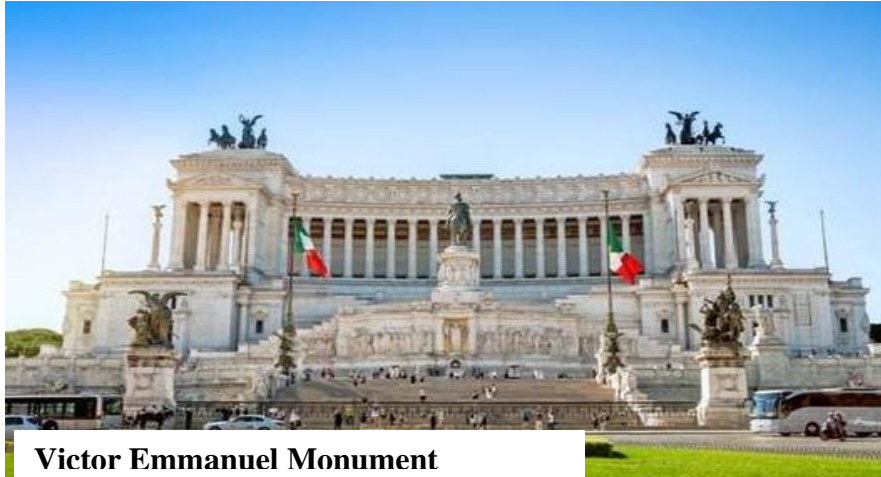
Victor Emmanuel Monument

Our journey unfolds as we travel to behold the magnificent Colosseum, an enormous amphitheater remarkably well-preserved. Following that, we'll explore the enchanting Trevi Fountain. According to legend, tossing a coin over your