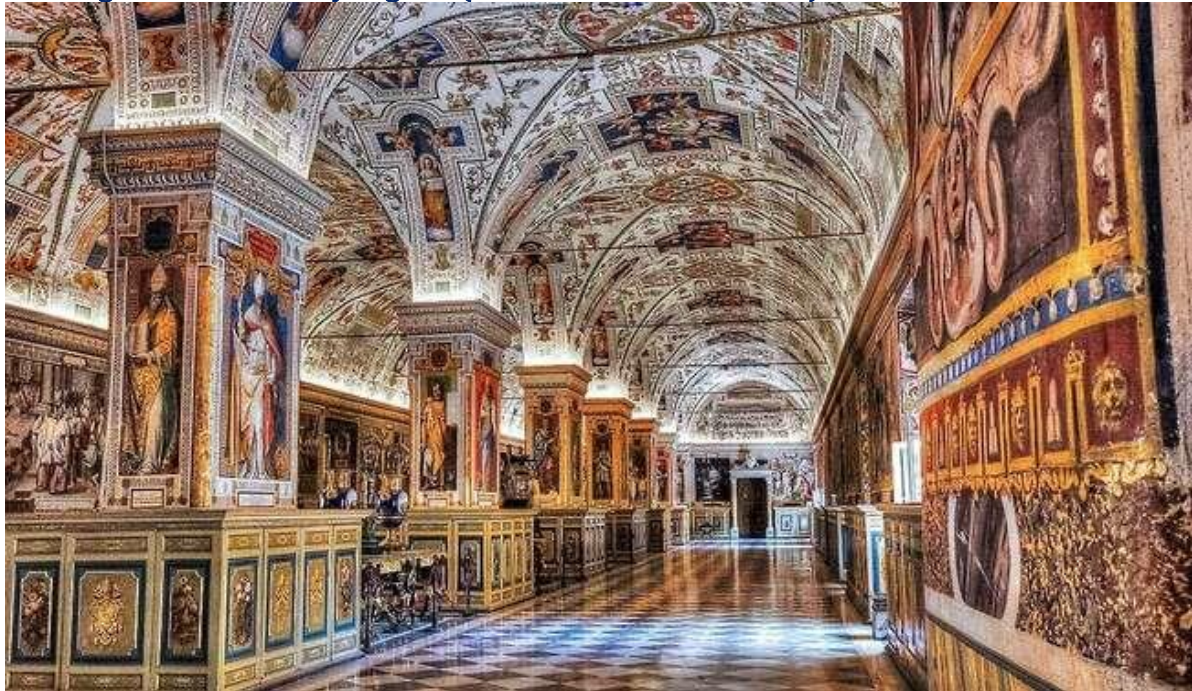
Vatican Museum with Sistine

Overnight in the Tuscany region. (Breakfast, Lunch, Dinner)