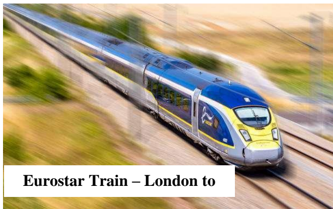
Eurostar Train – London to

Check out of your hotel and proceed to travel by high speed train from London to Paris. Eurostar (02 nd Class) is a high-speed train service connecting London with Paris through the Channel Tunnel. Offering a swift and efficient journey, it provides a seamless travel experience between these iconic European cities. After disembarking proceed to the fashionable and elegant city Paris, known for its haute couture,