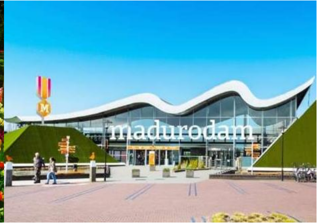
Madurodam from 13 th