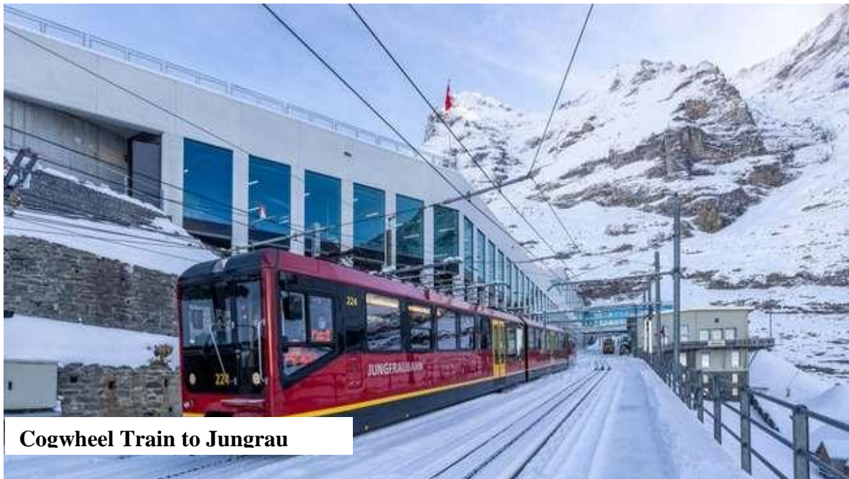
Cogwheel Train to Jungfrau

lakes, providing awe-inspiring mountain vistas and serving as a portal to various alpine escapades. Following that, we embark on a distinctive adventure, where you'll traverse Interlaken in a horse-drawn carriage from either the Voegeli riding school or Rossel Kutschenbetrieb, relishing the sights of the Jungfrau range—much like people did over a century ago..