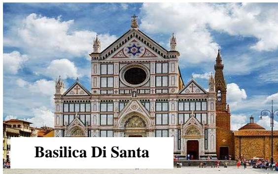
Basilica Di Santa

This morning, following your hotel checkout, we will commence a journey to Florence, often hailed as the birthplace of the Renaissance. Accompanied by a guide fluent in English, you will delve into the vibrant culture of this historical city.