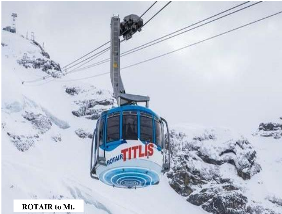
ROTAIR to Mt.

Overnight in Central Switzerland. (Breakfast, Lunch, Dinner).