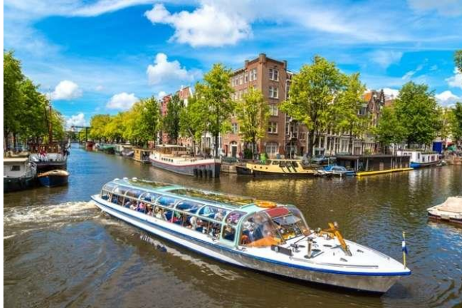
Amsterdam Canal Cruise