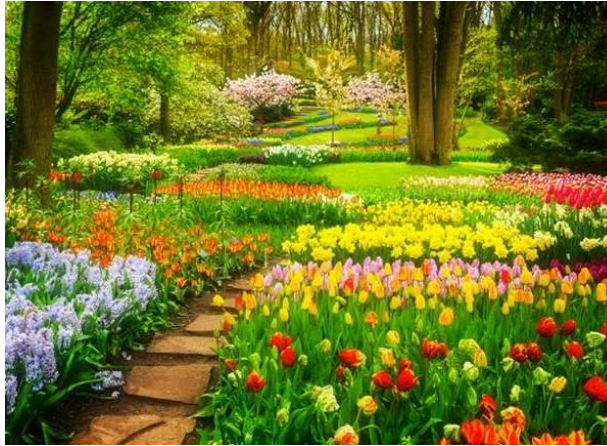
Keukenhof Gardens till 12 th