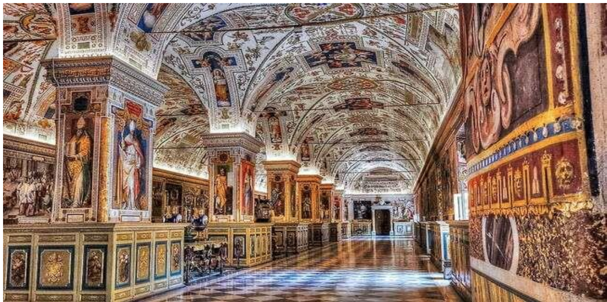
Vatican Museum with Sistine

Overnight in the Tuscany region. (Breakfast, Lunch, Dinner)