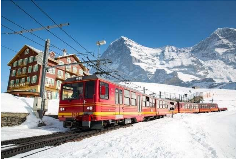
Cogwheel Train to Jungfrauoch included

Embark on a scenic journey to Switzerland after departing from your hotel.