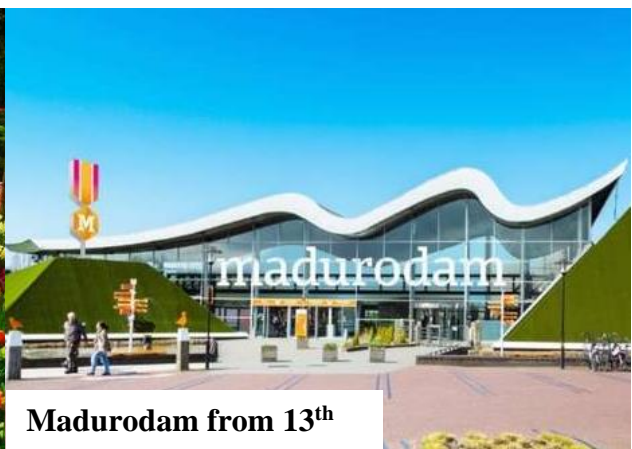
Madurodam from 13 th

State Express Global Voyages- 1 st Floor, Bhanot House, 17, Community Centre, Gulmohar Enclave Extensin, New Delhi – 110049