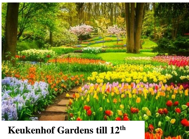
Keukenhof Gardens till 12 th

Overnight in Paris. (Breakfast, Lunch, Dinner)