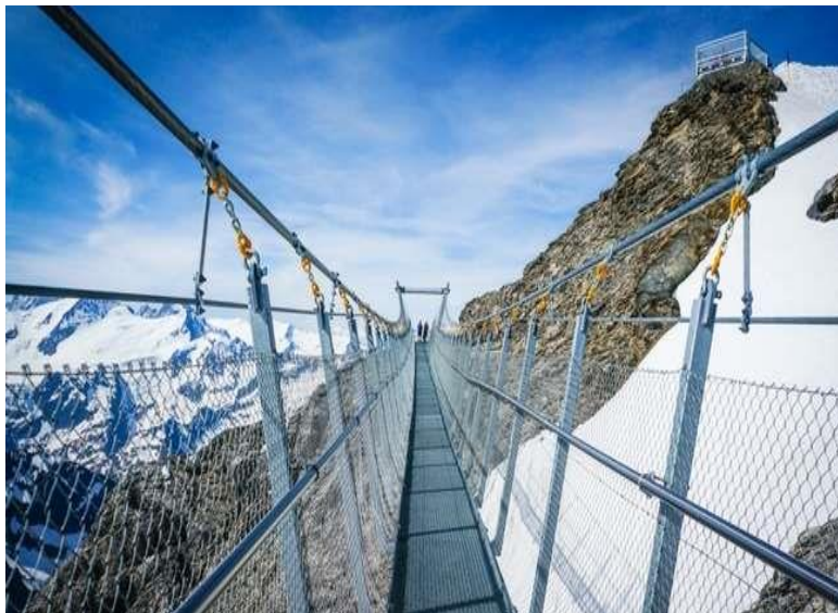
Mt. Titlis Cliff Walk

Today enjoy amazing scenery, a once in a lifetime experience with an exhilarating tip to the top of Mt Titlis at 3020 meters on various cable cars including Rotair, the world's first revolving cable car. Get a breath taking unrestricted 360 degrees stunning view of the