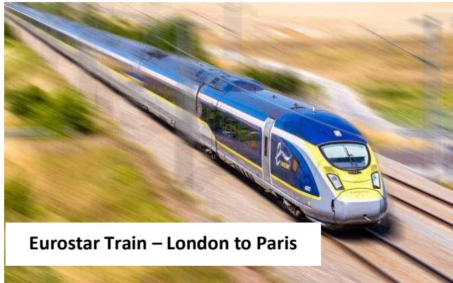
Eurostar Train – London to Paris

Check out of your hotel and proceed to travel by high speed train from London to Paris. Eurostar (02 nd Class) is a high-speed train service connecting London with Paris through the Channel Tunnel. Offering a swift and efficient journey, it provides a seamless travel experience between these iconic European cities. After disembarking proceed to the fashionable and elegant city Paris, known for its haute couture, renowned museums, breath-taking beautiful monuments and sensational cabarets. En