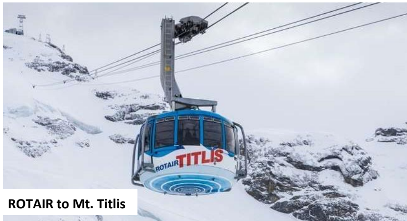
ROTAIR to Mt. Titlis

Our adventure extends to Lucerne, where you'll enjoy mesmerizing landscapes and an extraordinary experience. We'll embark on an exciting journey to the summit of Mt. Titlis, reaching a height of 3,020 meters through various cable cars, including the Rotair, recognized as