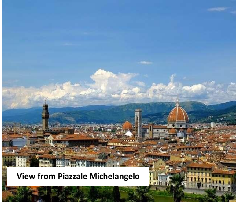
View from Piazzale Michelangelo

View the remarkable and famous Leaning Tower of Pisa. Photostop at