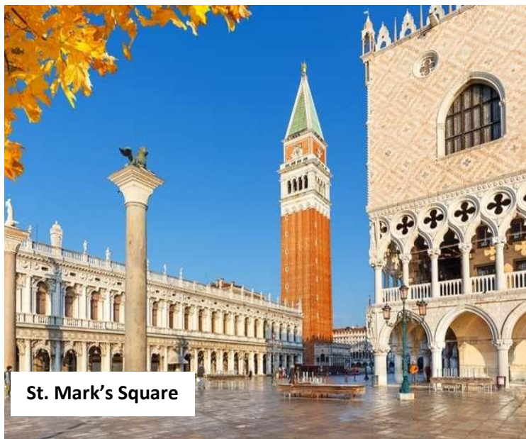
St. Mark's Square

The day concludes with an overnight stay in Innsbruck/Seefeld, offering a blend of cozy comforts and picturesque surroundings. (Breakfast, Lunch, Dinner)