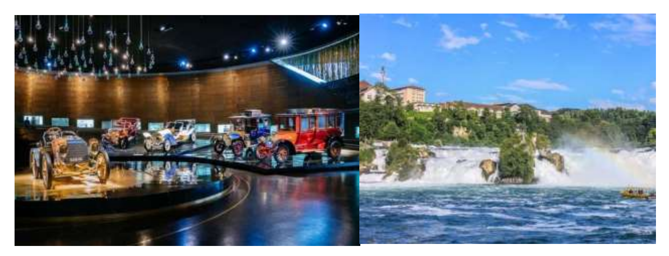
Mercedes Benz Museum