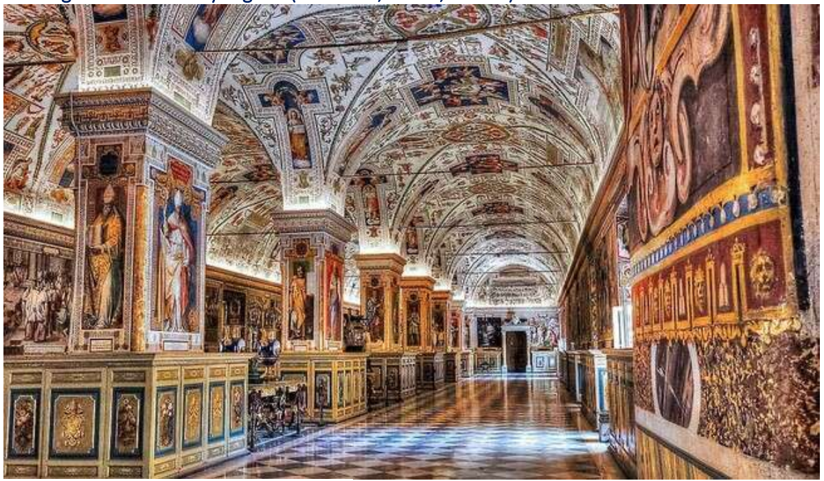
Vatican Museum with Sistine

Overnight in the Tuscany region. (Breakfast, Lunch, Dinner)