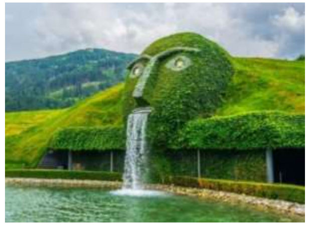
Swarovski Kristallwelten Wattens

Innsbruck, the picturesque Tyrolean capital of Austria.